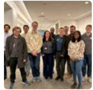
Team members from JPMorgan Chase and Community Shelter Board

CSB was awarded a technology support grant from JPMorgan Chase’s Force for Good program to enhance its Homeless Hotline. This initiative pairs JPMorgan Chase employees with nonprofits to solve real-world challenges through technology.