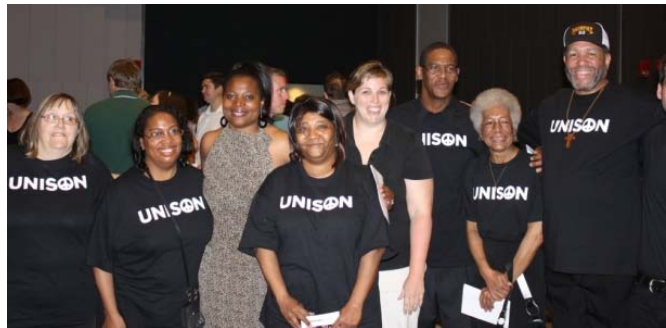
Members of the Unison Choir and staff from National Church Residences