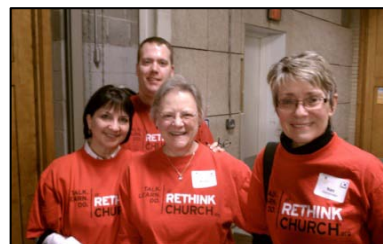
Volunteers from Broad Street United Methodist Church