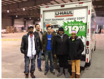
Chase collected so many items that a U-Haul truck was needed to transport the donations.