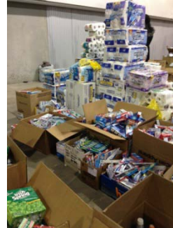
Donations reached more than 6 feet high.