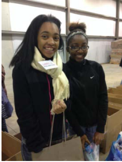
Students from Eastmoor Academy worked to sort items for storage in the shelter.

As part of the Day to End Homelessness campaign, caring people throughout central Ohio collected bedding, toiletries and other supplies needed for the new shelter building that will open later this year. A drive-thru donation event was held at the new shelter on Saturday, Feb 1, where dozens of volunteers accepted and sorted donations.