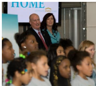
Students from Sullivant Elementary School